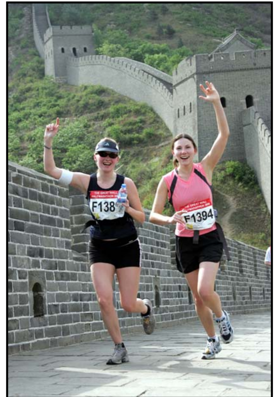
The Imperial Run

Please note: You must personally sign this agreement. By signing you acknowledge that you have read, understood and accepted the Exclusion of Liability contract.